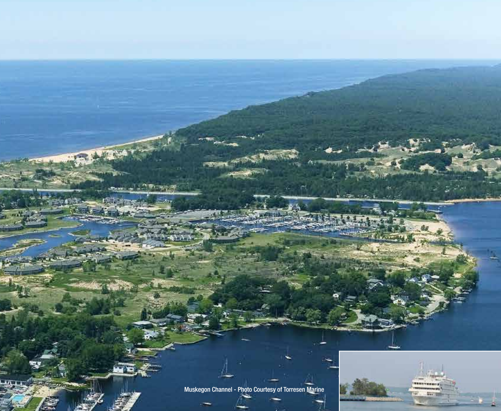
Muskegon Channel