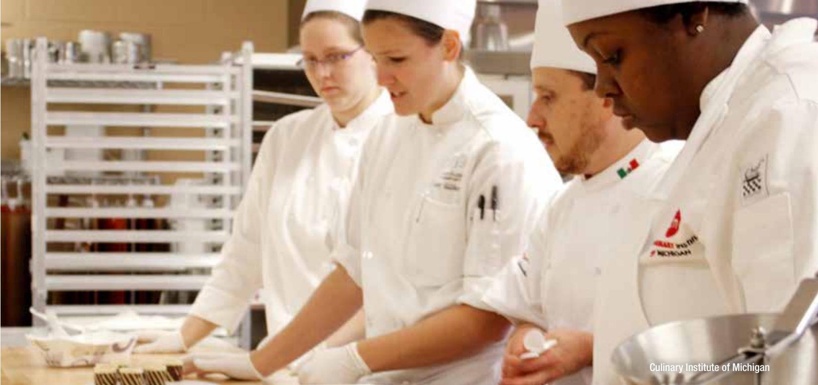
Culinary Institute of Michigan