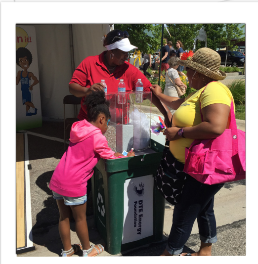
Education for the future