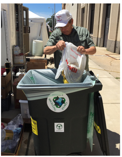
ABOVE: A food vendor discards banana peels into the food waste collection container.