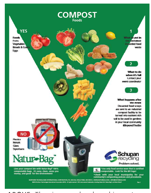
ABOVE: The signage, developed in partnership with Natur-Bag, that was distributed to food vendors.

As a result of increased efforts, organic compost increased by 435% from 2015 to 2016.